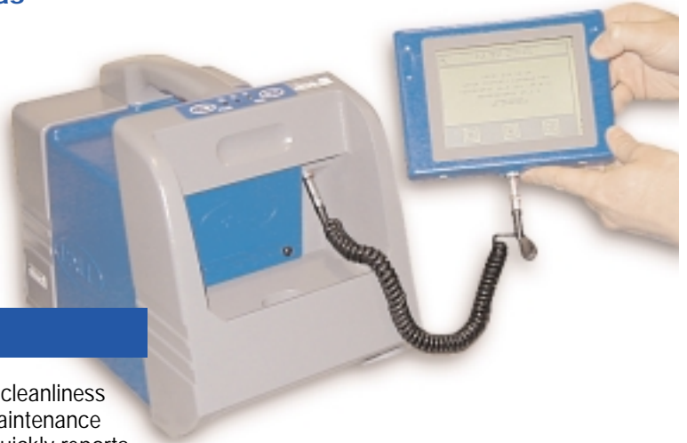
PCM400 Cleanliness Monitor

The Pall® PCM400 is specifically developed as a portable diagnostic monitoring device that provides an assessment of system fluid cleanliness.